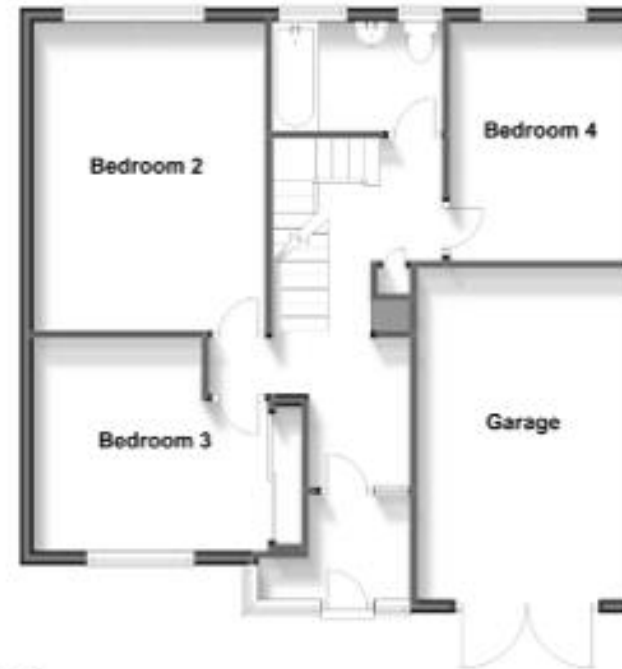
First Floor Approx. 26.1 sq. metres (281.2 sq. feet)