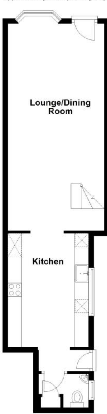
Ground Floor Approx. 44.8 sq. metres (481.7 sq. feet)