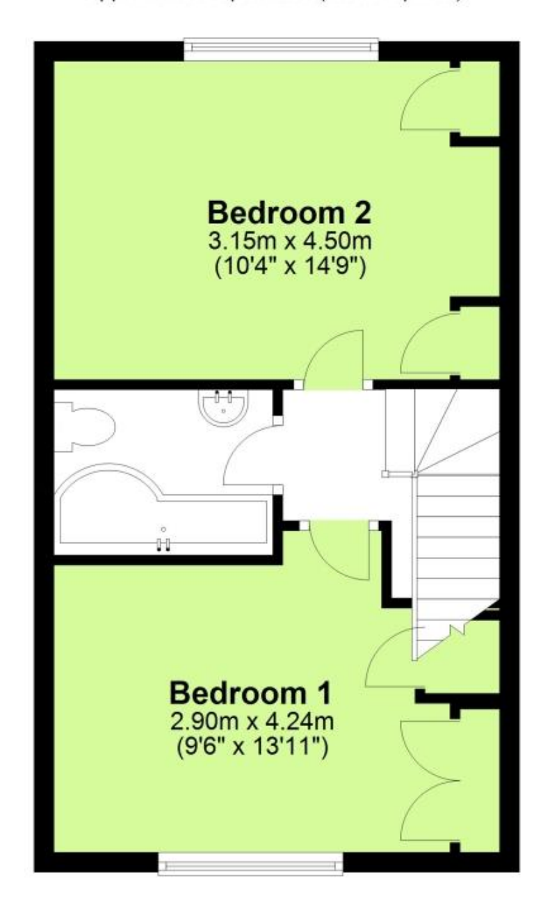
Total area: approx. 72.4 sq. metres (779.6 sq. feet)

Approx. 35.6 sq. metres (383.7 sq. feet)