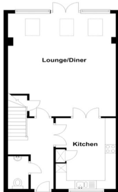
Ground Floor Approx. 52.2 sq. metres (562.2 sq. feet)