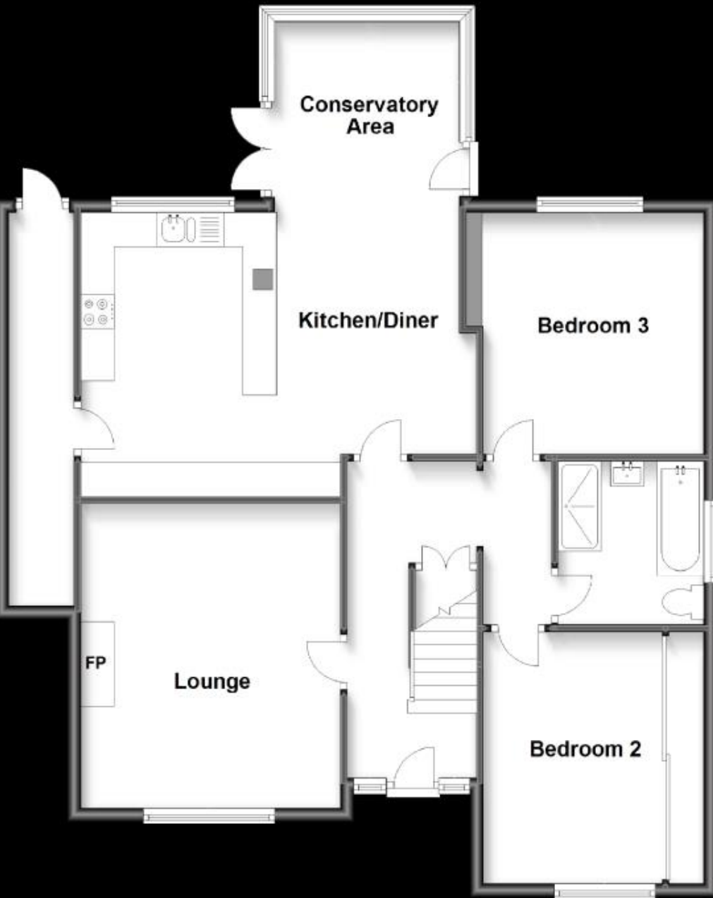
Split Level Ground Floor