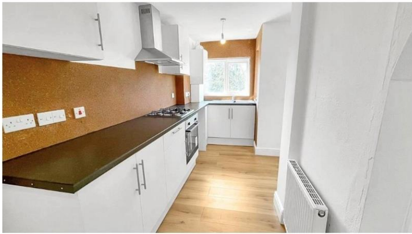
3 of 10 Picture No. 05