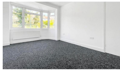
8 of 10 Picture No. 07