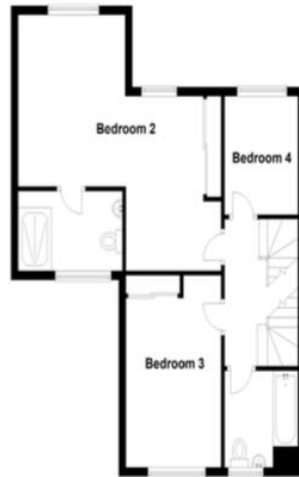
First Floor Approx. 56.9 sq. metres (612.5 sq. feet)